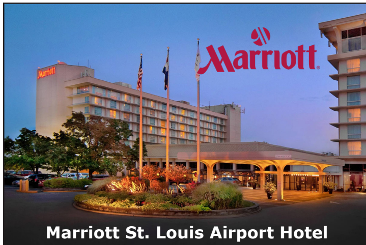
Marriott St. Louis Airport Hotel

Guest Room Booking Website: https://www.marriott.com/event-reservations/reservation-link .